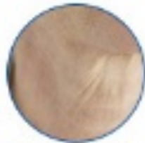
Anti Neck Profile