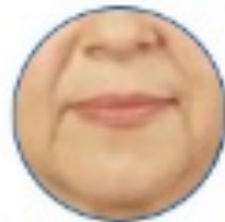
Take Away Nasolabial Folds