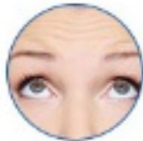
Eliminate Forehead Wrinkles