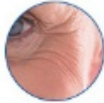
Remove Fine Lines