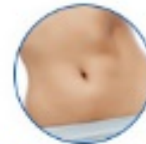
Waist fat reduction