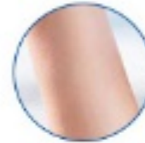
Arms fat break